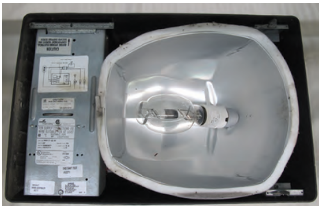
BEFORE (shoebox fixture) ballast box and metal halide