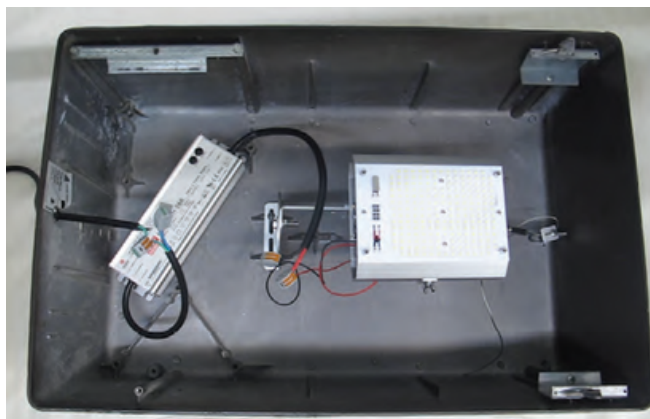
AFTER (shoebox fixture) LED module, driver, L Bracket mount