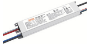
Emergency Battery 8W, 900LM, 90MIN (Sold separately)