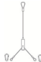
Aircraft Cable Description: 10FT long (Sold separately)