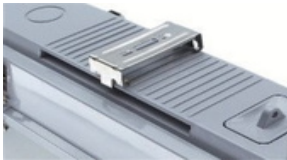
Mounting Bracket (Standard)