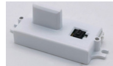
Microwave Sensor NO.: HD027VCR Description: 12VDC input (Sold separately)