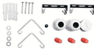
Hardware bag (Standard)