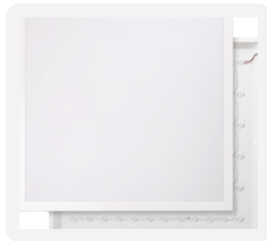
Extruded aluminum lens frame with visually seamless corners