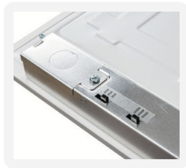
Field-selectable CCT and wattage control provides flexibility to installation and stocking